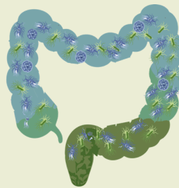
MISTRAL participant with low microbial diversity and high levels of inflammation

All findings are still under review and are not yet final.