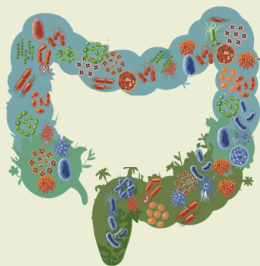
MISTRAL participant with high microbial diversity and low levels of inflammation

People living with HIV who have elevated levels of inflammation in their blood tend to have a less diverse gut microbiome . In other words: they have fewer bacterial species that are less evenly distributed in the gut.